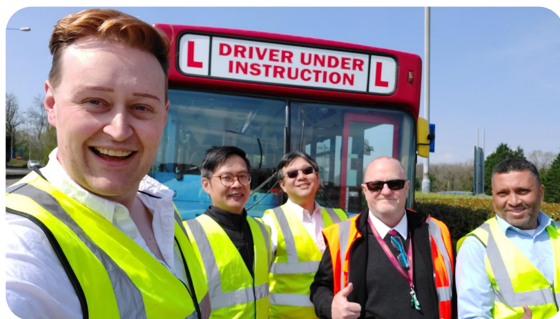
Adventure Travel photo

We look forward to you joining our team as a trainee. If you have any questions about the training process then contact the Recruitment Team at Jobs@AdventureTravel.Cymru